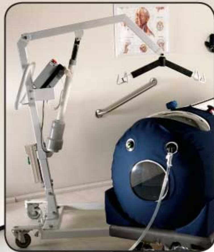
With an optional lift system, a patient may easily be placed into the chamber

Direct audible communication with patient